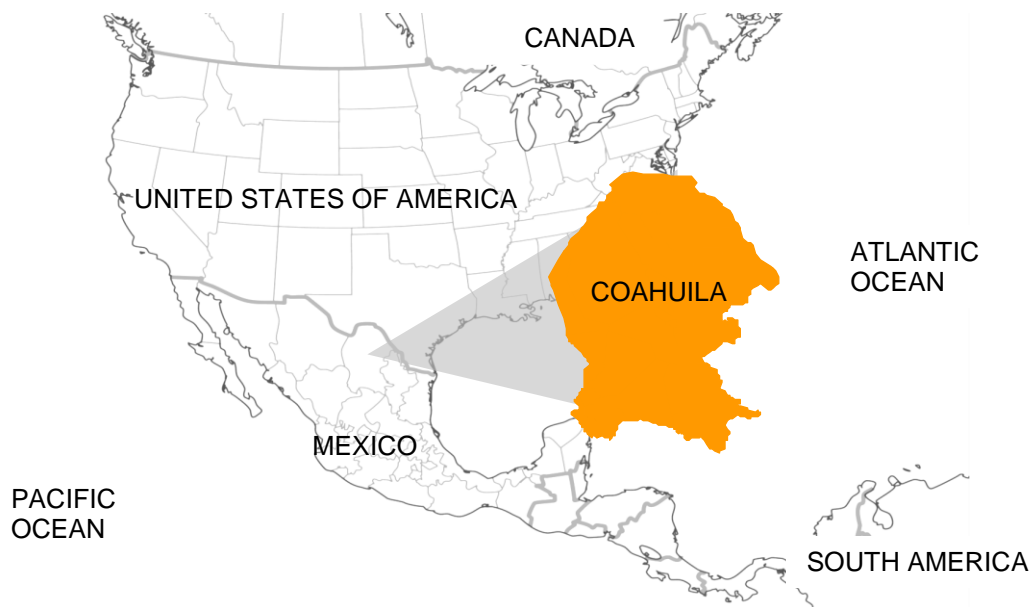
Location of Coahuila de Zaragoza in North America

Coahuila de Zaragoza is the third largest state in the country, located in northeastern Mexico and shares a 512-kilometer border with the U.S. state of Texas. In Mexico it borders the states of Chihuahua, Durango, Zacatecas, San Luis Potosí and Nuevo Leon.